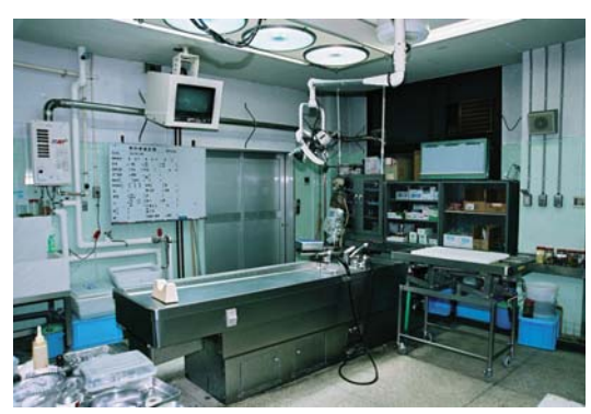
Forensic autopsy room